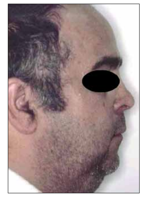
FIGURE 1 - Patient with severe OSAS. Craniofacial and cervical morphology demonstrating a Class II standard with mandibular bony base involvement, short neck, widened cervical circumference and excess fat in the submental region.

A disproportionate oral cavity anatomy, due to soft tissue (principally tongue volume) or hypodevelopment of the maxillomandibular bone structure, can be assessed by applying the Modified Mallampati Classification. The patient is placed in a seated position with maximum mouth opening and a relaxed tongue; the examiner then observes the dimension by which the oropharynx is exposed and classifies the results from I to IV, in accordance with the greatest or least visibility of the free edge of the soft palate relative to the tongue base (Fig 2). The size of the palatine tonsils must also be evaluated (Fig 3), including the aspect of the pillars that can be voluminous or average and the uvula and soft palate, which can contribute to