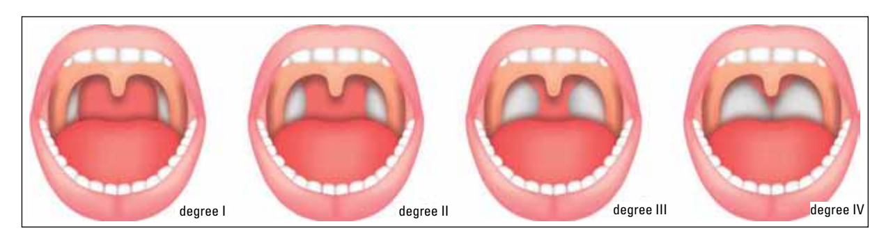
FIGURE 3 - Graduation of palatine tonsils: Degree I, Palatine tonsils occupy up to 25% of the oropharyngeal space; Degree II, Palatine tonsils occupy between 25% and 50% of the oropharyngeal space; Degree IV, Palatine tonsils occupy more than 75% of the oropharyngeal space.