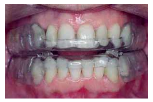
FIGURE 4 - "BRD Appliance" (Brazilian Dental Appliance): mandibular repositioning appliance for the treatment of snoring and OSAS.<sup>27</sup>