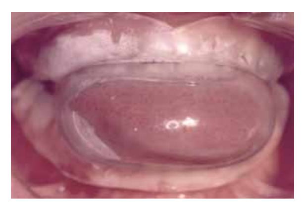
FIGURE 5 - "Tongue Retaining Device" (TRD).<sup>26</sup>

3. Who failed to undergo CPAP or behavioral treatment;