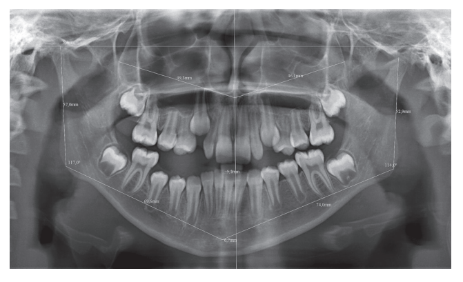
Figure 4 - Lemos asymmetry analysis performed on patient with unilateral (right side) posterior crossbite.

corpus of the mandible on both sides (LCL, RCL), the reference in the present study was an anatomic point on the mandible (Pg), which is the midpoint of the mandible often seen in orthopantomograms as an white spot on the midline.<sup>14</sup> Thus, this analysis can also be applied to patients with missing incisors, regardless of the type of malocclusion.