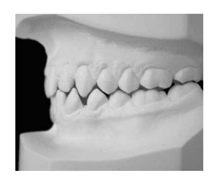
FIGURE 1 - Plaster casts of an individual with Class I malocclusion used in the sample.

were placed on a glass plate (Fig 2a), at a distance of 20 cm from the camera (Fig 2b). At the bottom of each model a black device was placed with a marking in the center, used as reference to centralize the teeth that would be photographed (Fig 2c), as described in a previous study.9