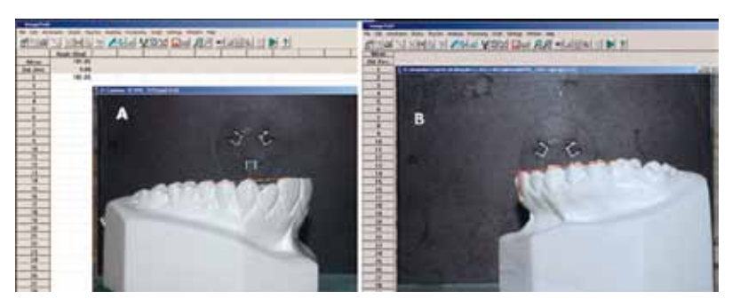
FIGURE 3 - Photograph of plaster study model exported to image editing program to obtain measurements of canine angulation (A) and incisor inclination (B).

When necessary, photograph brightness and contrast were adjusted in order to enhance visualization of structures, thereby providing a sharper outline of the teeth. The occlusal plane was traced from the incisal surface of the central incisors to the mesiobuccal cusp of the first permanent molar to determine both canine and incisor inclination. Canine angulation measurements were then