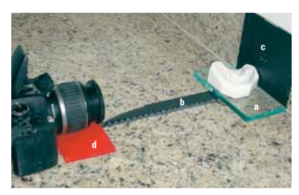
FIGURE 2 - Method used to standardize how photographs of plaster models were taken to determine canine angulation.

A total of 360 photographs were taken and later exported to a computer program (Adobe Photoshop 7.0®) where the occlusal plane was traced (Fig 4). Those images were subsequently imported into an image editing program (Image Tool® – www.imagetool.com) where canine angulation and incisor inclination were measured.