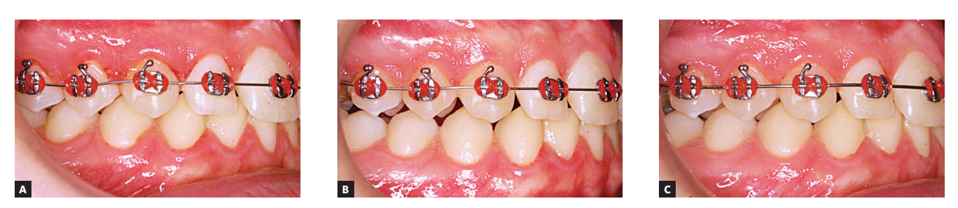
Figure 2 - Control side: intraoral photographs at T_0 (A), T_{14} (B) and T_{56} (C).

Means followed by different letters (small letters in lines and capital letters in columns) are significantly different according to Tukey-Kramer test ( \rho < 0.05 ).