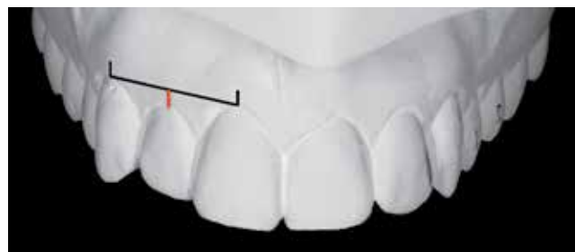
Figure 1 - Analysis of the gingival zenith of the maxillary lateral incisor, obtained from a line tangent to the GZ of the canines and central incisors.

For statistical analysis the Software R 2.10.1 was used and the statistical significance level was defined at 5%. For all the analyses, the Shapiro-Wilk test was