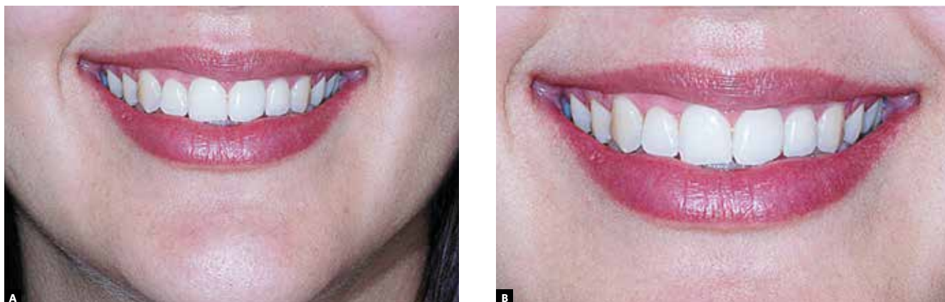
Figure 1 - Photograph cropping. A) Original photograph. B) Photograph after cropping, reducing the area to be evaluated.

Using the Adobe Photoshop 9.0 software, six vertical lines were projected on the images of the smiles and positioned on the outer commissures, distal of upper canines and on the distal of last visible upper