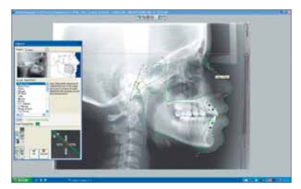
FIGURE 4 - Determining the points and performing the cephalometric tracing