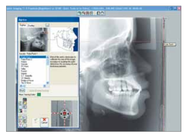
FIGURE 3 - Determining start and end points on the ruler (measurement

According to Albuquerque-Júnior and Almeida,1 examiners can interfere significantly with systematic effects, affecting the reproducibility of cephalometric values. Silveira and Silveira<sup>22</sup>