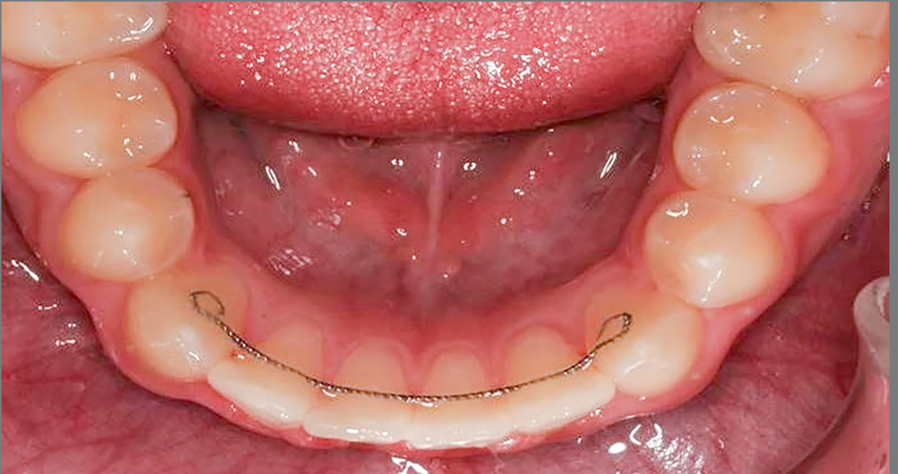
Figure 1: Multi-strand wire retainer bonded to the lingual surfaces of mandibular anterior teeth.