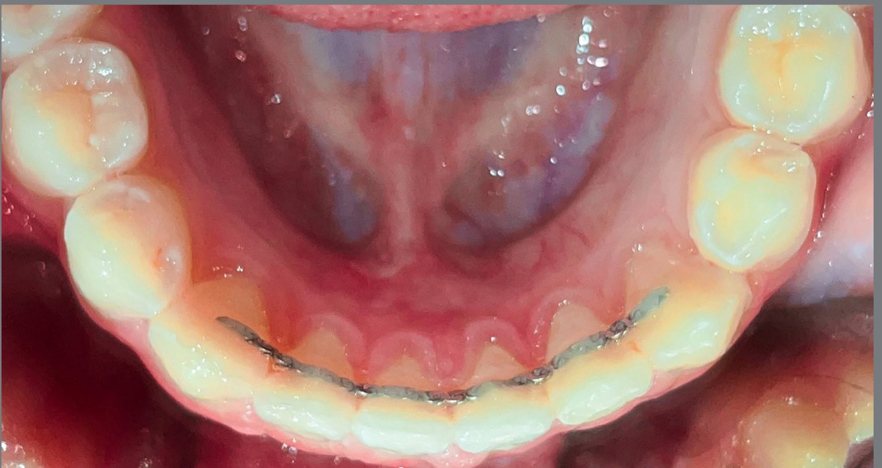
Figure 2: Ortho-Flex-Tech™ wire retainer bonded to the lingual surfaces of mandibular anterior teeth.