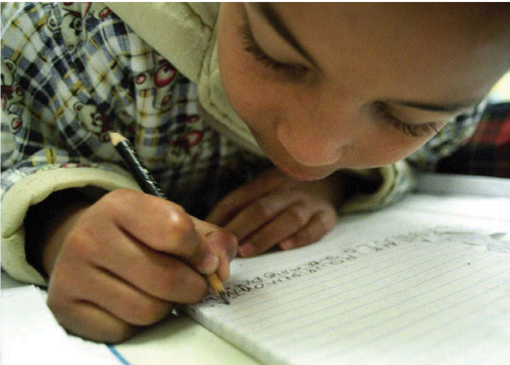
A student uses a pencil to write down dictated words in a public school class in São Paulo.