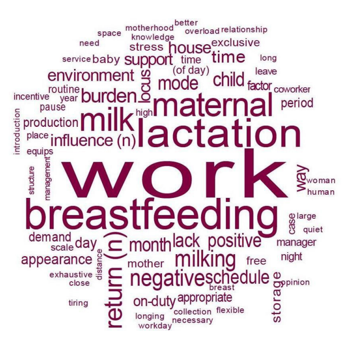
Figure 1. Word Cloud with the occurrence of terms about the influences of Nursing workers returning to work on breast-feeding. Rio de Janeiro, Brazil, 2020.

DHC allowed for the segmentation of the textual corpus into classes of text segments (TSs) and their terms, in which the central