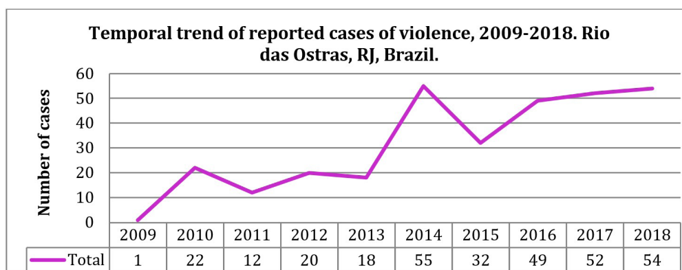
Figure 1. Descriptive temporal trend of reported cases of violence, years 2009-2018 ( n=315 ). Rio das Ostras, RJ-Brazil, 2020

It appears that some children suffered more than one type of violence related to the same reported event. In this context, sexual violence prevailed among children aged 5 to 9 years ( n=64/50.0\% ) as well as psychological/moral ( n=34/52.3\% ). On the other hand,