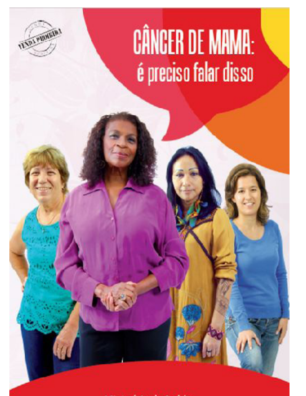
Ministério da Saúde Instituto Nacional de Câncer José Alencar Gomes da Silva