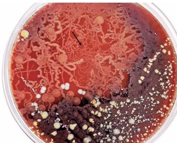
Figure 1. Blood agar plate after a 24-hour incubation

Line drawing among bacterial colonies (arrows).