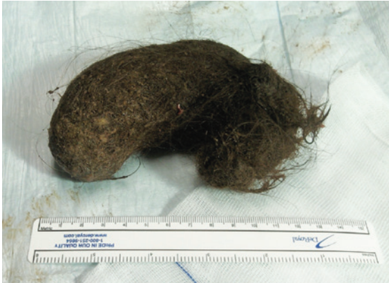
Figure 1. Gastric trichobezoar removed after the first laparotomy