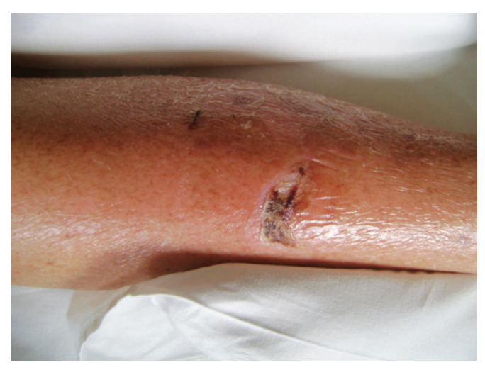
Figure 1. Right lower limb with edema and hyperemia

of jaundice, non-palpable lymph nodes, no hemorrhages or petechiae. His heart auscultation revealed ++/6holosystolic murmur audible in mitral focus with radiation to axilla. At auscultation of the chest no adventitious sounds were heard. The patient had a flabby and painless abdomen, edema and hyperemia in the right lower limb, and fever (Figure 1).