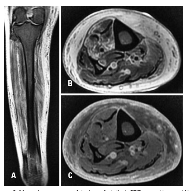
Figure 3 . Magnetic ressonance of the lower limb (leg): STIR coronal images (A) T2FS axial (B) axial with contrast T1FS (C) indicating: edema, thickness, diffuse subcutaneous enhancement suggesting a inflammatory/infectious process. Edema in the leg muscle bundle mainly in the anterior and posterior deep compartments was noted

During his hospitalization acute sepsis was controlled, but myeloma activity (Table 2) and renal insufficiency