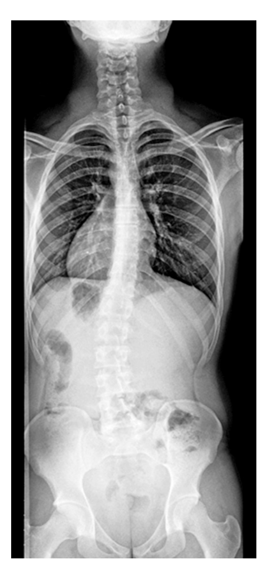
Figure 3. Panoramic radiograph of the total spine showing thoracolumbar sigmoid scoliosis and dextrocardia

In conducting the case, when serial CBC were run posteriorly, the patient presented with a variation in the platelet count (64,000/\mu\text{L}) up to normality range values). Since it was a case of mild thrombocytopenia tending towards a benign course, watchful waiting was