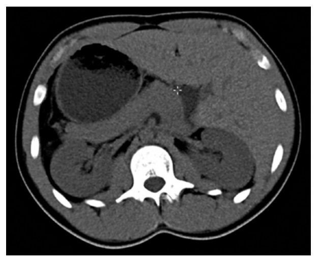
Figure 2. Computed tomography of the total abdomen in cross-sectional view showing abdominal organs in a mirrored position relative to their normal topography.