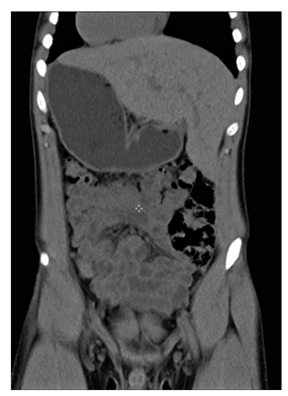
Figure 1. Computed tomography of the total abdomen in coronal view showing abdominal organs in a mirrored position relative to their normal topography

Magnetic resonance of the lumbosacral spine showed lumber scoliosis with convexity to the right in decubitus, a congenital deformity in the posterior arch of L5 and S1 (thinning and deformity), and edema of the spinous ligament of L4/L5. On the radiograph of the total spine