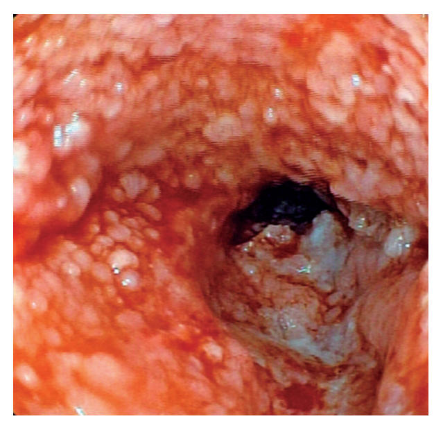
Figure 4. Lesion involving the whole esophageal circumference

A 73-year-old woman with history of dysphagia, and mild diabetes controlled with drugs and diet. The patient was also referred to endoscopy. She reported social drinking, and denied smoking. At the procedure a long papillary esophageal lesion, with about 10 to 11cm in length was noted in the middle portion of the esophagus, proximally involving part of the circumference, but progressing to involve the whole circumference (Figure 4). The distal esophagus was normal. Biopsies showed the same aspect of esophageal papillomatosis seen in the patient 1. The patient 2 refused surgical treatment and she has been followed with regular 6-month endoscopies for 3 years now, but no changer have been seen in endoscopic and histological aspects.