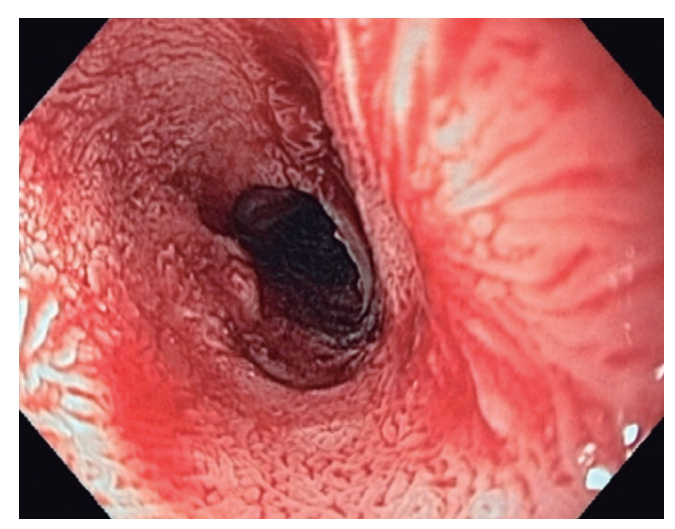
Figure 1. Extensive papillary lesion involving the whole esophageal circumference in patient 1 \ensuremath{\mathsf{1}}