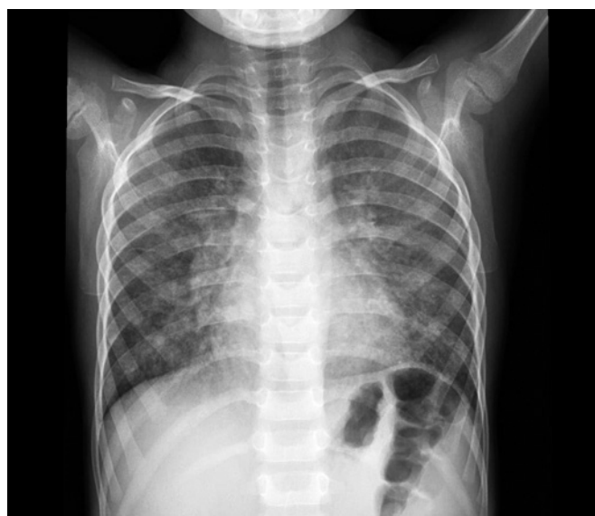
Figure 1. Chest X-ray. Diffuse bilateral opacity with ill-defined edges, with a predominantly central location

and intestinal series, intestinal scintigraphy and enteral magnetic resonance imaging were normal. As such, given the iron-deficiency anemia with characteristics compatible with blood loss (although not identified), and despite the absence of respiratory symptoms at this phase, we started looking for other sources of hemorrhage, namely pulmonary. The chest radiograph showed a diffuse bilateral opacity with ill-defined edges, with a predominantly central location (Figure 1), suggestive of alveolar hemorrhage.