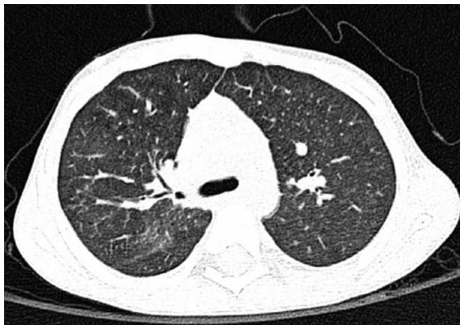
Figure 3. Chest computerized tomography scan. Diffuse increase of the parenchyma's density with no zone predominance, with dispersed areas of lower density, and several small dispersed nodules

After starting steroid treatment there was a progressive increase in Hb level and improvement of radiological