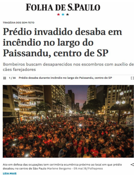
[Squatted building collapses in fire in Paissandu Square, downtown SP]