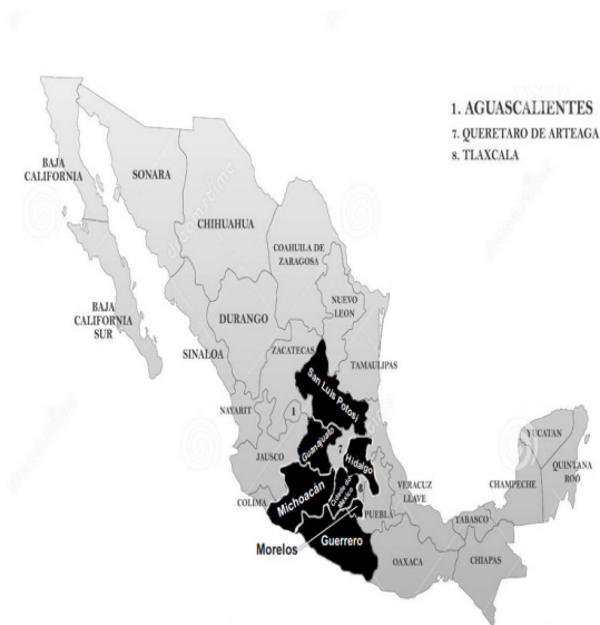
FIGURE 3 – Map of the route of Lourenco Filho in Mexico