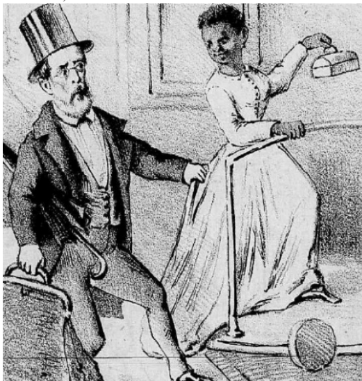
PICTURE 1 – ILLUSTRATION OF THE NEWSPAPER “O MEQUETREFE” (THE GOOD-FOR-NOTHING)

SOURCE: “O Mequetrefe” (The Good-for-nothing).