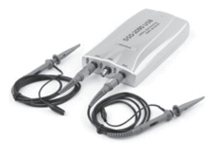
Figure 1. DSO 2090 with two channels

Participants were submitted to the pulmonary function test by spirometry, which was conducted according to the criteria by the American Thoracic Society (ATS, in 1999) and the Guidelines for Pulmonary Function Tests, in 2002, in a portable spirometer<sup>18,19</sup> (IQ TeQ Spirometer, version 4.891, South Africa). After a five-minute rest, three forced, reproductive and acceptable vital capacity tests were performed. The analyzed variables were forced