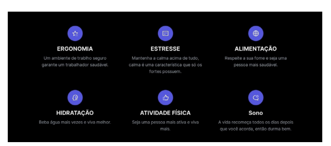
Figure 3. Software application home screen, with interactive buttons