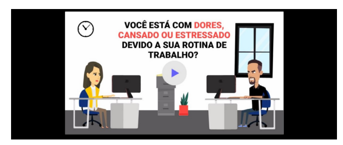
Figure 2. The software application home screen, with explanatory video

After this first step, the user answers to a brief questionnaire for data screening and definition of the notifications that will be issued. Thus, the website generates a personalized model of interventions aimed at changing the user's lifestyle habits. The notifications indicate the recommended actions every 30 minutes (Figures 2 to 4).