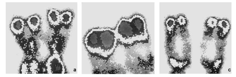
Figure 2 - a-c, Replication high density patterns in endoreduplicated CHO chromosomes. The graphic images closely corresponded to the density paterns detected in normal chromosomes.

The specific and complex density patterns found in the subtelomeric segments and the induction of holes in normal and aberrant chromosomes topologically matched