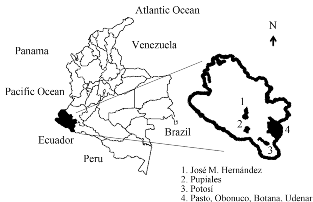
Figure 1 - Geographical location of the Nariño department in Colombia.

Allele frequency, expected ( H_e ) and observed ( H_o ) heterozygosity, as well as estimated unbiased diversity for all the loci in the different lines and populations, were obtained through TFPGA software (Miller et al. , 1997). Based on sample size, FSTAT software (Goudet, 2001) was used for calculating allelic richness. Polymorphic information content (PIC) (Botstein et al. , 1980) was estimated with Cervus software (Marshall et al. , 1998). By means of the Raymond and Rousset (1995) method, an exact test was carried out to establish deviations from Hardy-Weinberg equilibrium.