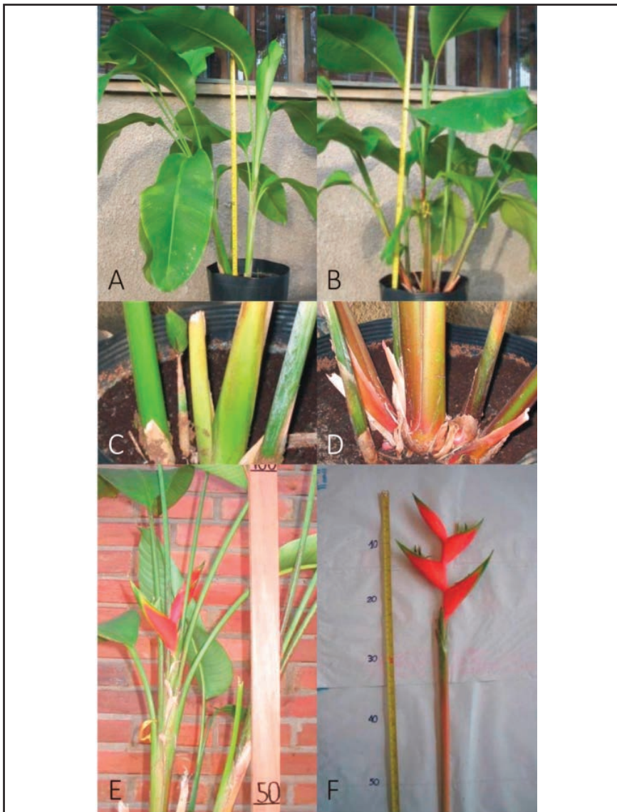
Figure 1. Development of H. bihai cv. Lobster Claw Two plants in the greenhouse: rhizome-derived plants at 240 days in the experiment (A) and plant derived from the in vitro cultivation of zygotic embryos (B); Pseudostem of rhizome-derived plant (C) and of plant derived from the in vitro cultivation of zygotic embryos at 240 days into the experiment (D); Inflorescence obtained in the plant derived from the in vitro cultivation of zygotic embryos at 279 days into the experiment (E); Inflorescence at harvest point at 291 days into the experiment (F). Recife, UFRPE, 2014

Twenty percent (20%) of plants derived from in vitro culture issued the inflorescence tip at the 266 th day (8 months and 13 days into the experiment). At the 275 th day, the first bract was already open (Figure 1E). The harvest