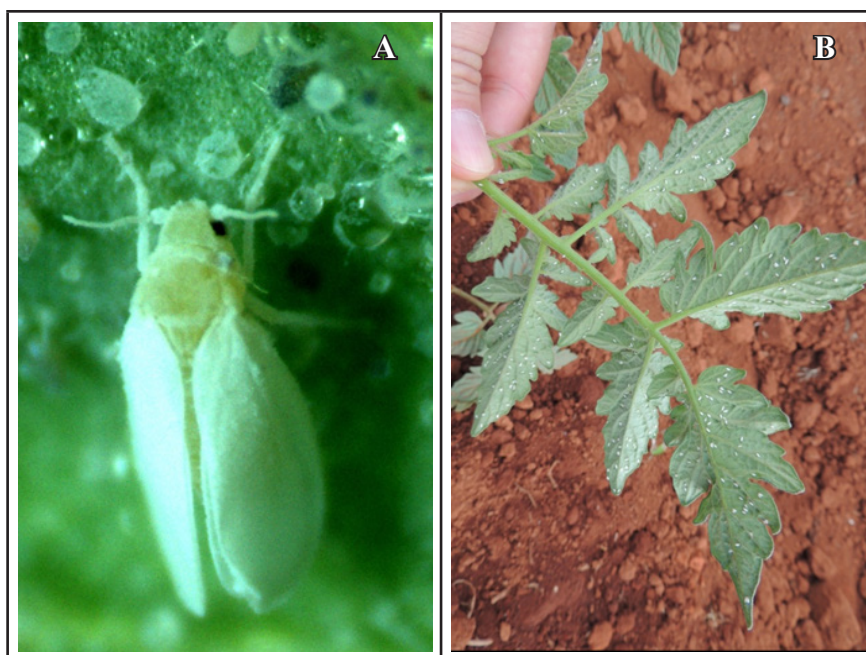
Figure 3. Adult of whitefly Bemisia tabaci (A) and a tomato leaf infested by adult whiteflies (B) {adulto da mosca branca Bemisia tabaci (A) e uma folha de tomateiro infestada por adultos da mosca branca (B)}. Brasília, Embrapa Vegetables, 2015.

chlorotic spot virus (Table 1; Coco et al. , 2013; Fernandes et al. , 2009). Symptoms of begomovirus infection in soybean include stunting, distorted growth and blistering, chlorotic spots, and light green to golden-yellow mosaic/mottling of leaves. Thus, under high begomovirus