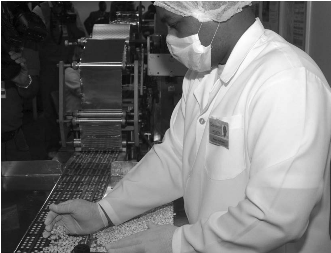
Figure 7: Packaging of drugs in antiretroviral drug factory, in Maputo, 2010