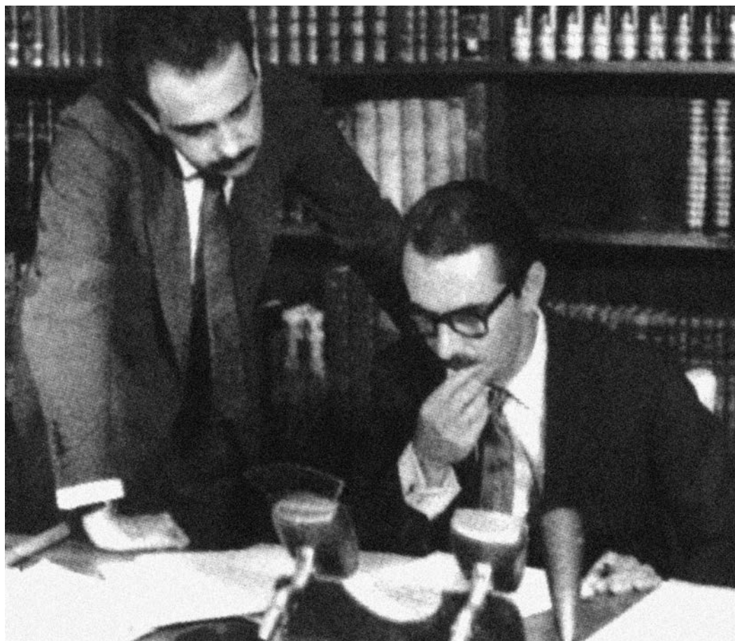
Figure 1: José Aparecido de Oliveira and Jânio Quadros in the office, n.d. (Branco, 1996, p.121)

The 1964 coup profoundly changed these foreign policy arrangements. At the start of president Castelo Branco's mandate, there was a radical return to the Americanist paradigm, emphasizing the East-West conflict to the detriment of the globalist perspective, which had proposed the pragmatic alignment of Brazil with other Third World countries. In the new national policy context, Brazil projected itself, internationally, as part of the capitalist bloc. The fear of the expansion of the communist world can be perceived in Brazil's international position then, to the extent that Brazil began to support Portugal's colonization of Africa as a way to suppress the independence movements there, which were seen as acts of soviet expansionism (Pinheiro, 1988). These factors were unfavorable to the continuity of both