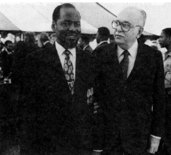
Figure 2: Joaquim Chessano, president of Mozambique, receiving Ambassador José Aparecido de Oliveira, in Maputo, n.d. (Braga, 1999, p.73)

President Fernando Henrique Cardoso’s mandate began in the context of a considerable reduction in investment in African foreign relations – the number of Brazilian diplomats on the continent dropped from 34 to 24 between 1989 and 1993. The institutionalization of the CPLP 2 on June 17, 1996 is emblematic because it occurred during a period in which Brazil-Africa relations were being deemphasized. This was evidence of the important role that the government planned for the CPLP as the focus of Brazil’s relationship with the