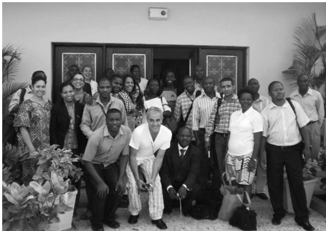
Figure 6: Professional Education in Healthcare Specialization Class in Maputo, 2011