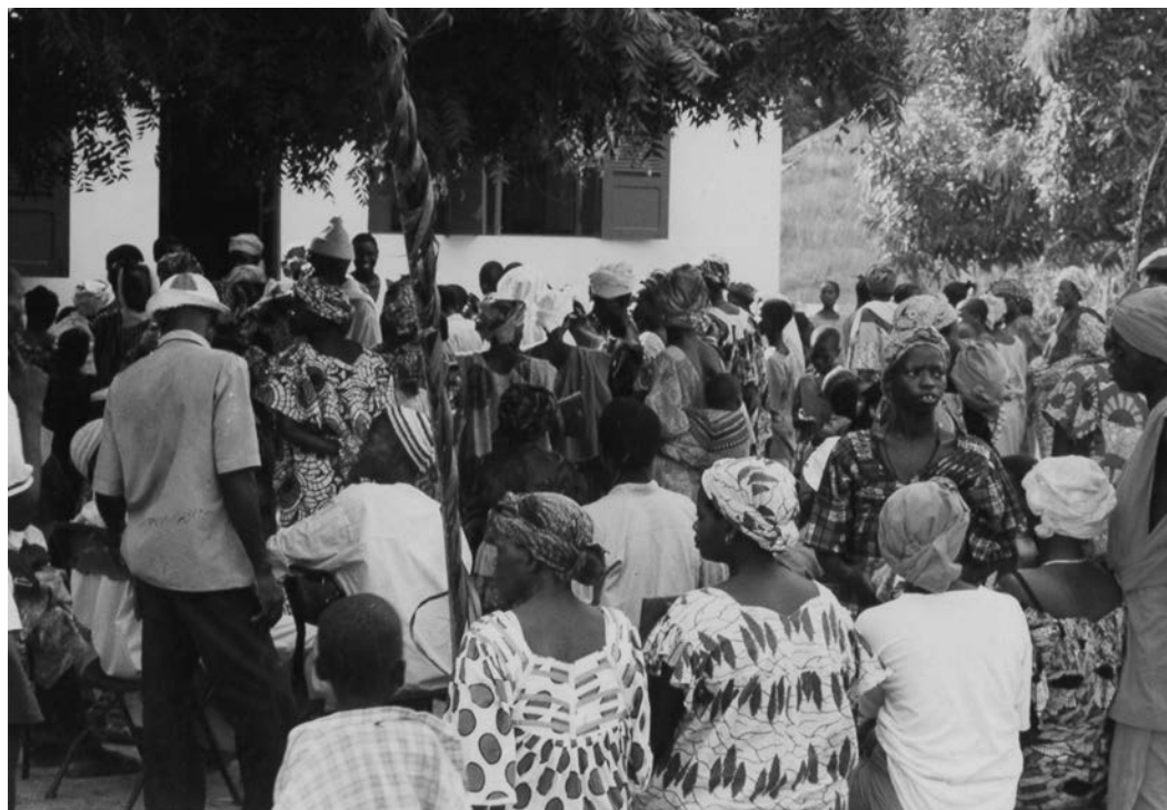
Figure 4: Community gathering during the inauguration of a health center in a rural area, first Fiocruz PALOP mission, in Guinea-Bissau, 1997

Armed conflict and political instability in some countries contributed to postponing the implementation of the project for another two years. However, during this period ties were strengthened with departments of the World Health Organization (WHO), initially with the Pan American Health Organization (PAHO/WHO) and with the Regional WHO Office in Africa, both interested in promoting technical cooperation with the PALOP countries. These institutions, together with representatives from Portuguese-speaking African countries, the Brazilian Cooperation Agency (BCA) of the MFA, the Federal University of Rio de Janeiro and the Fiocruz National Public Health School (Ensp/Fiocruz), participated in the Workshop on Technical Cooperation for the Development of Human Resources, held in 2000 in Rio de Janeiro, at Fiocruz (Ensp, maio-jun. 2000).