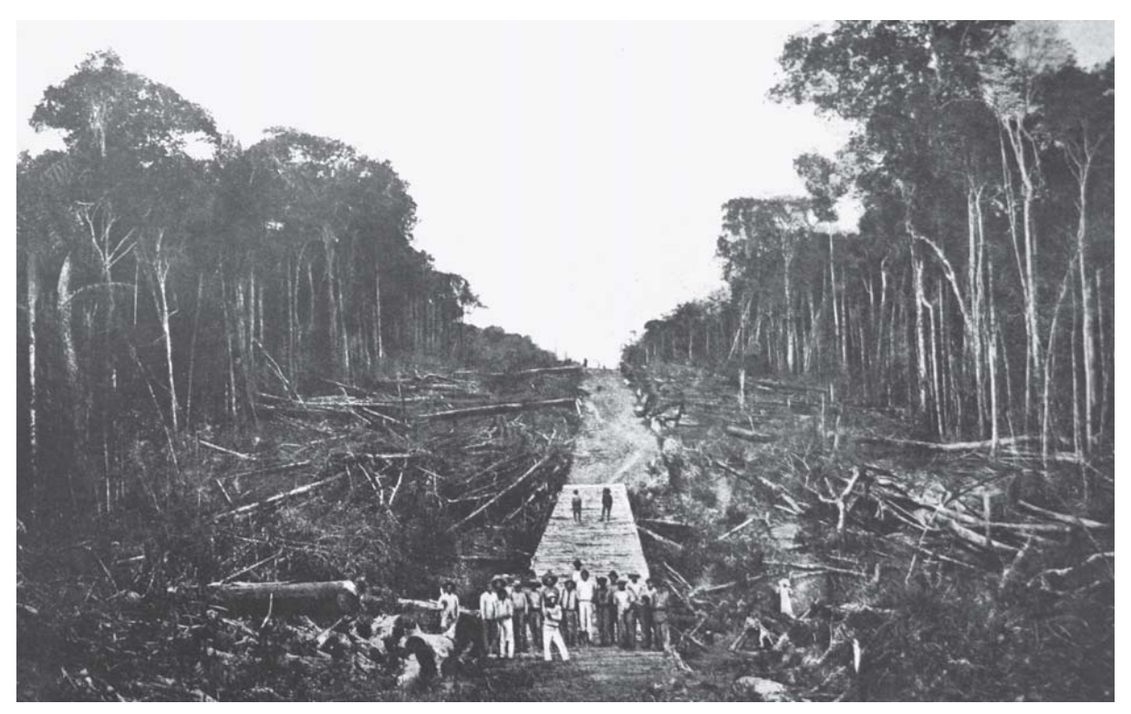
Figure 3: "Trecho do picadão através da mata, vendo-se ao centro a faixa destocada para estrada de rodagem" (Stretch of right-of-way through the woods, with center section graded for the roadway; Rondon, s.d.-b, estampa 30).