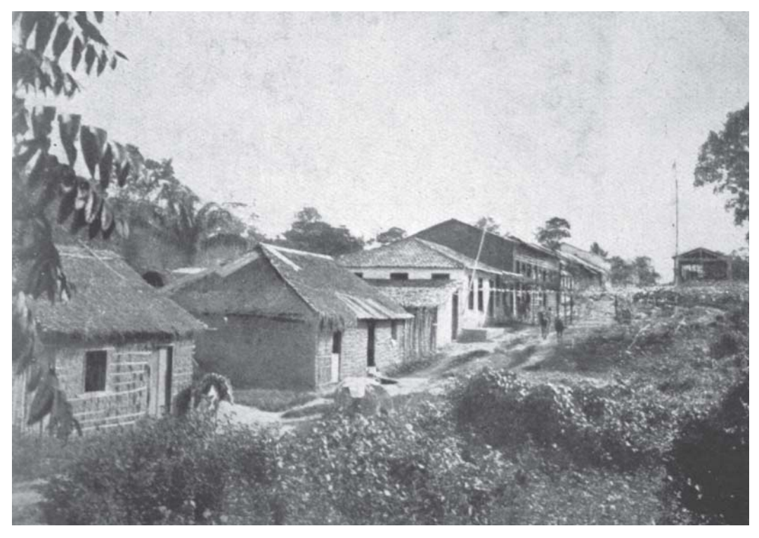
Figure 5: "Uma rua de Santo Antônio do Madeira" (Street in Santo Antônio do Madeira; Ferreira e Silva, 1920)