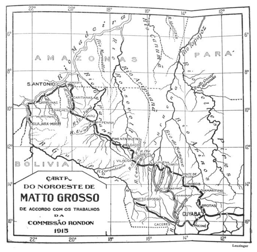
Figure 4: "Reprodução do esquema projetado durante as conferências do coronel Rondon e onde se vê o tracado da linha telegráfica, a estrada de automóveis e os principais rios descobertos ou explorados" (Reproduction of a schematic drawing shown during Coronel Rondon's conferences, indicating path of telegraph line, roadway, and main rivers discovered or explored; Rondon, 1916)

The main source of documentations for this study – commission medical reports – allows us to conclude that the hardships encountered in endeavoring to promote and settle the northwestern region of Brazil stemmed largely from the diseases that not only afflicted those residing in these regions but also frightened off potential settlers. This combination produced a telegraph line that over the years came to symbolize not the integration of this region with the rest of the country but rather a monument to the memory of the CLTEMTA project.