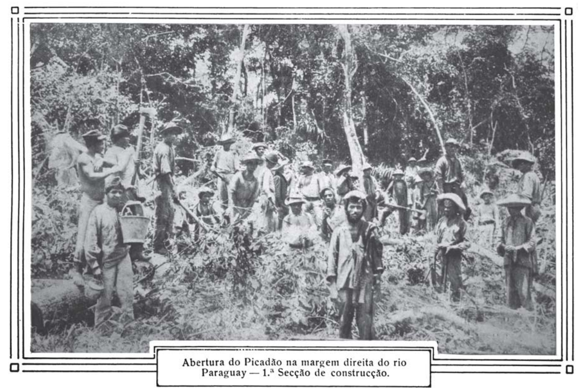
Figure 2: "Abertura do picadão na margem direita do rio Paraguai" (Opening right-of-way along the right bank of the Paraguay River; Rondon, s.d.-b, estampa 6)