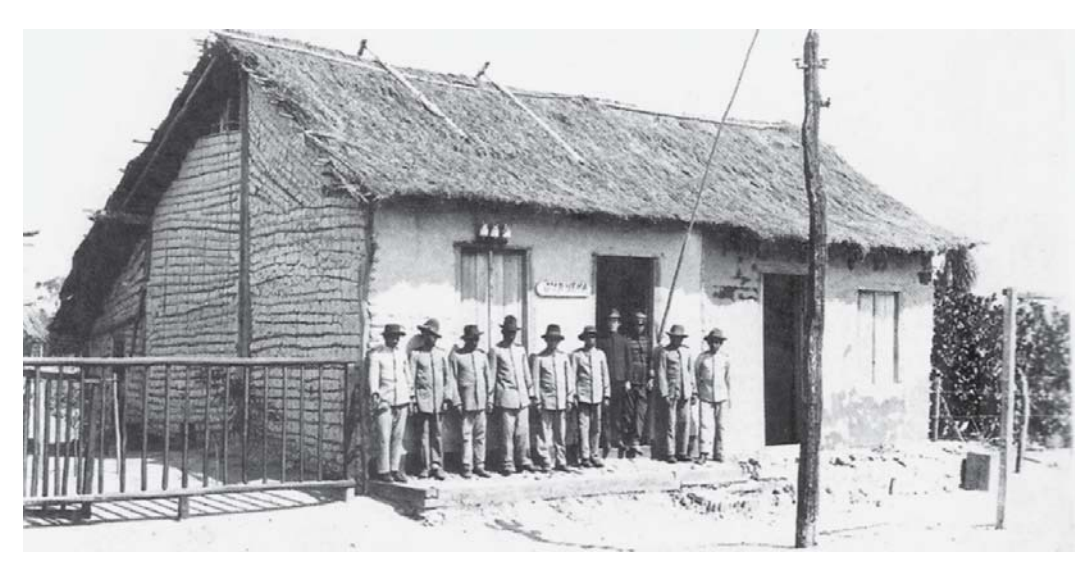
Figure 6: Juruena Station. Photograph, José Louro (Lasmar, 2008, p.80, fotografia 51)