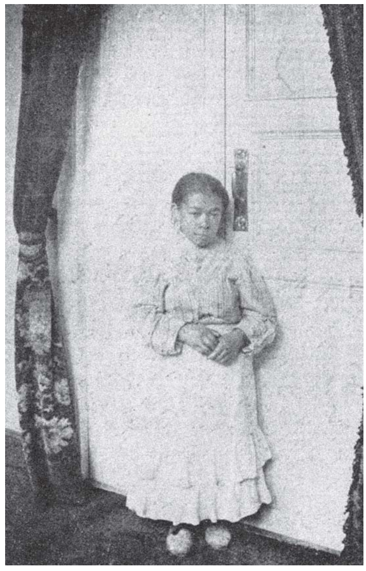
Figure 4: Clotilde N., case of infantilism with mental puerilism, described by Luis Felipe Calderón (1913)

Similarly, it is posible to state that clinicians introduced an etiological explanation that relates climate, hygiene, degeneration-heredity (pathological flaw) and poverty, as seen in the study of polyglandular syndromes carried out by Luis Felipe Calderón around 1913. The presence of the illness is found both in subjects and in the space they inhabit,