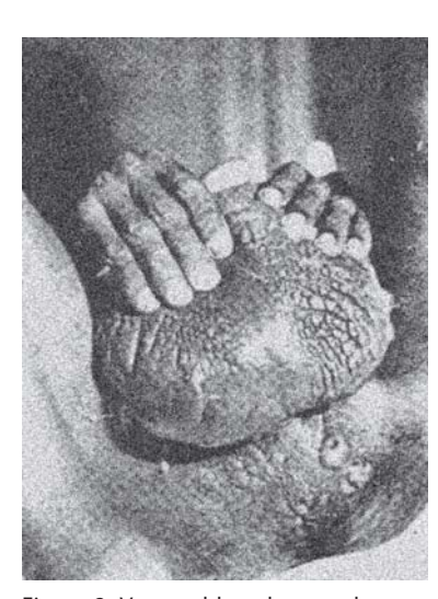
Figure 2: Venereal lymphogranuloma. Recto-genital syndrome with multiple fistulas and elephantiasis of the scrotum (Pardo Castello, 1941, p.350)

The problem of racial degeneration, which articulates concepts like climate, disease, deformity, monstrosity and pathological flaw, can be seen in the study of diseases of the thyroid gland, specifically in disorders known as polyglandular syndromes. In the National Congress of Medicine held in 1913 in the city of Tunja, Dr. Luis Felipe Calderón presented a research paper entitled "Polyglandular syndromes of the highlands", in which he argued that the denomination of signs of degeneration should be applied to organic states in the outward appearance of individuals, to geographic and climate conditions, and to hereditary memory. For Calderón (1913), these elements of degeneration were evident in the endocrine disorders amongst inhabitants of the Cundiboyacá highlands, a place where, according to him, there were