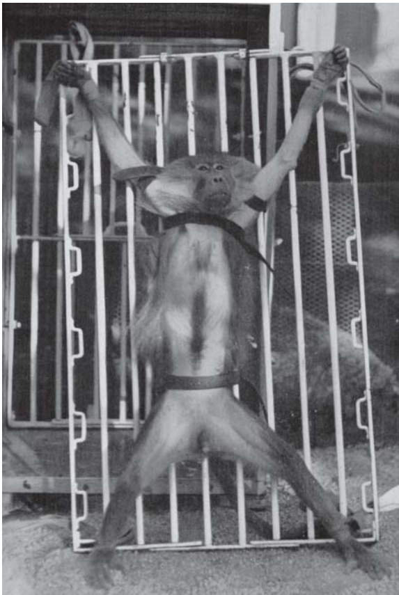
Figure 1: Simian used in Voronoff's experiment. (Voronoff, 1928)