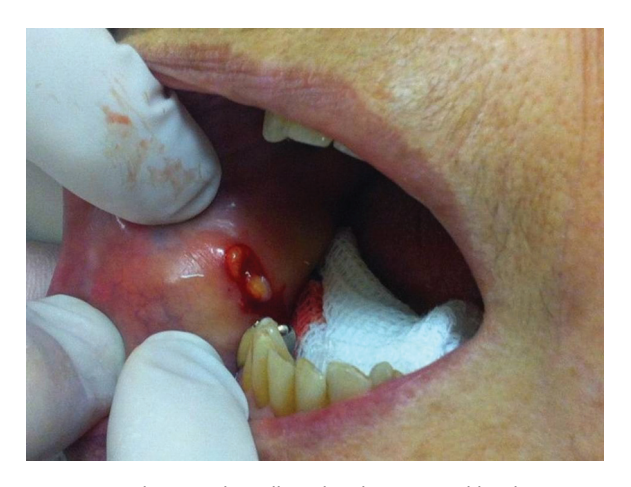
Fig. 1 Biopsy showing the yellowish coloration and hard consistency from right buccal mucosa.

To determine the patient's past medical history, a slide review was requested, which confirmed the previous histopathologic results. The confirmation of the previous facial filling was stated by the patient's caregiver, who said that the patient had facial plastic surgery 20 years before in a private clinic, which explained the lack of this information on the patient's medical records in our hospital.