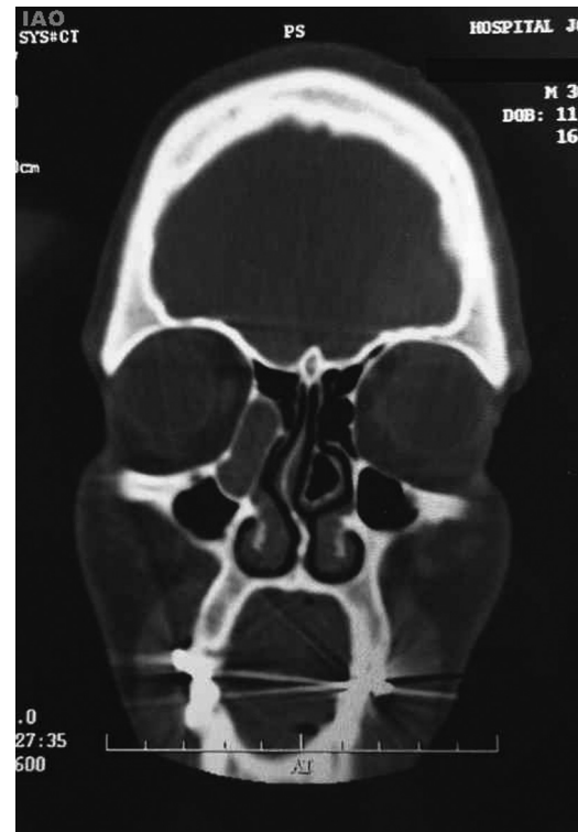
Fig. 2 Computed tomography of the paranasal sinuses, coronal section, in bone window, showing hypodense cystic lesion in the right nasolacrimal duct topography.

in blockage in the distal end of the nasolacrimal system, at the Hasner valve level, although the blockage can also occur at the lacrimal spot. 2,3,5