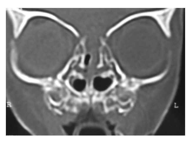
Fig. 1 Coronal CT of a neonate with bilateral choanal atresia with soft tissue density in nasal cavity appeared continuous with brain parenchyma due to lack of ossification along the floor of the anterior cranial fossa, falsely appearing as a bony defect.

All neonates were diagnosed with bilateral CA by axial CT. Coronal CT showed soft tissue density in the nasal cavity