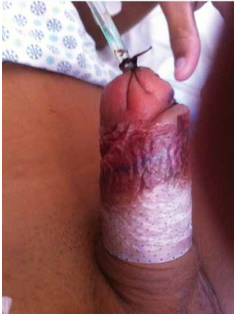
Figure 5 - Sugarcane biopolymer pellicle on the 8th day, before removal.