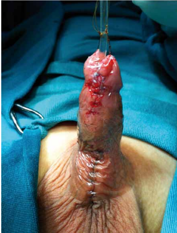
Figure 1 - Polyurethane pellicle molded to the penile shaft.