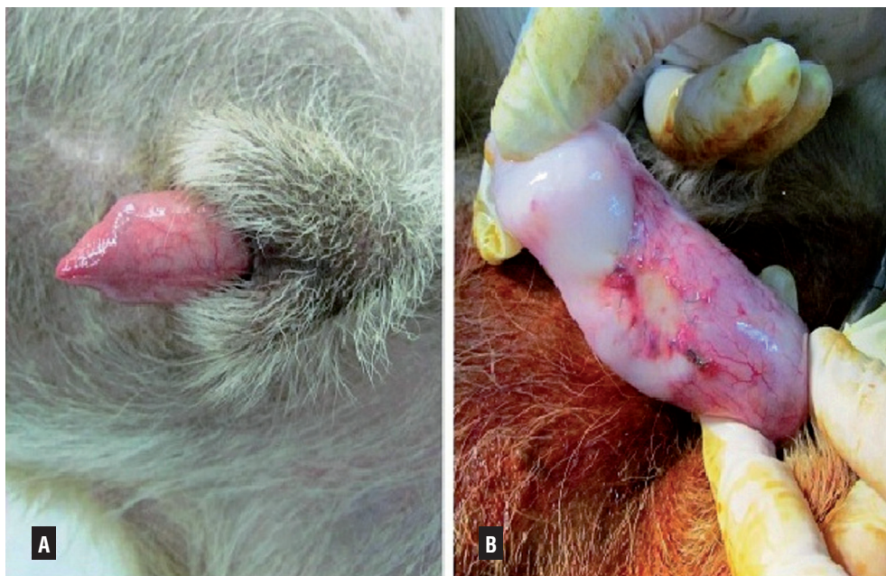
Figure 1 - The appearance of penile tunica albuginea before grafting (A) and 12 weeks after grafting (B).

posed of an outer longitudinal layer and an inner circular layer and the corpora are separated by an incompetent septum. Nevertheless, on the ventrum, the longitudinal layer of the tunica albuginea is absent and this potentially allows dorsal buckling more easily; this can explain why most patients with Peyronie's disease demonstrate lesions dorsally. The etiology and risk factors of Peyronie's disease, however, are not known completely. Some factors such as \beta blockers, urethral instrumentation, certain human leukocyte antigen subtypes, TGF- \beta (6), downregulation of matrix metalloproteinase (7), reduction in \alpha 1-antitrypsin level (8), oxidative stress, and cytokine release may have a role in the pathogenesis of the disease. In most cases, there are two phases. The first one is the active phase and is usually associated with painful erections and changing deformity of the penis. The second quiescent phase is described by stabilization of the deformity and disappearance of painful erections. A wide spectrum of medical and surgical treatments has been suggested for Peyronie's disease but none of them is perfect. Vitamin E, colchicine, intralesional corticosteroids, and intralesional Verapamil are among the medications usually prescribed for