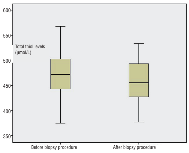
Figure 2 - Total thiol levels were significantly lower in men who underwent transrectal ultrasound guided prostate biopsy when compared to the levels just before biopsy (p=0.03, paired samples t test).

coefficient=-0.480, p=0.024, Pearson correlation analysis) and post-biopsy native thiol levels (correlation coefficient=-0.593, p=0.004, Pearson correlation analysis). Additionally, a significant negative correlation was also noticed between age and pre-biopsy (correlation coefficient=-0.444, p=0.039) and post-biopsy total thiol levels (correlation coefficient=-0.545, p=0.009). However, no statistically significant correlation was observed between any of the oxidative stress parameters and the total and free PSA levels, prostate volume and histopathology of the prostate (p >0.05, Pearson correlation analysis).