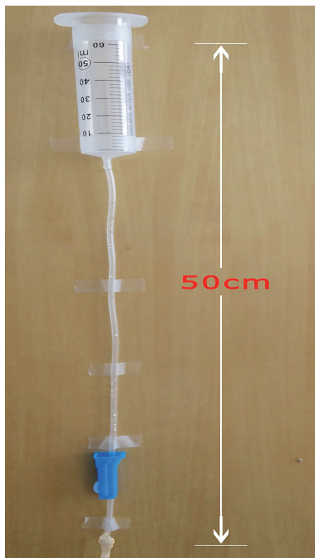
Figure 2 - A simple flow rate device.

sacrifice date and voided spontaneously throughout the study period, no signs of infection or flap necrosis were found postoperatively. Mild rupture of the distal ventral incision (approximately 3mm) occurred in one rabbit in group G1, this healed within 2 weeks.