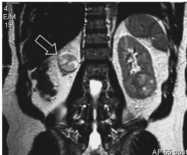
Figure 1 – Magnetic resonance imaging. We can see a 5-cm mass in the kidney bed (arrow), and a 5 cm mass in a single left kidney.

the pararenal and paracaval (para-aortic) tissue within Gerota's fascia remnants (Figure-3), is excised en bloc, placed in an Endo Catch-II (Covidien, Boston, MA, USA) bag and removed through an additional