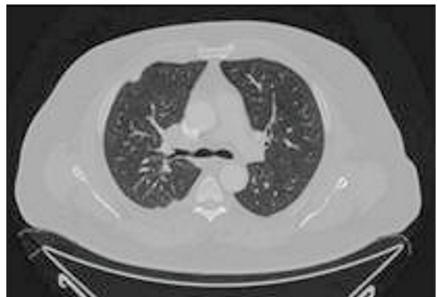
Figure 3 – Patient 1: CT scan with regression of the pleural effusion without thoracocentesis.