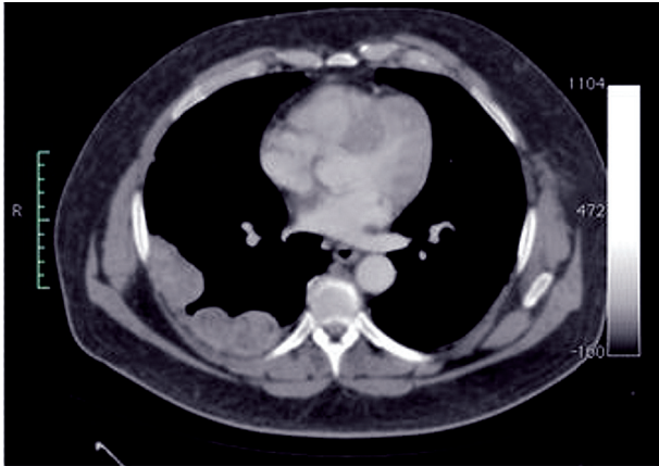
Figure 1 – Patient 1: Thoracic CT scan showing metastatic nodules.

11 months with sorafenib (12) and sunitinib (13), respectively. The use of DC vaccine has also shown promising results in some reported cases in the literature (9).