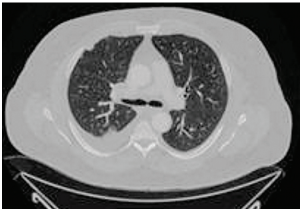
Figure 2 – Patient 1: CT scan showing pleural effusion among pleural metastasis.

The use of targeted therapy with DC vaccine after nephrectomy in metastatic RCC disease has not yet been published. It shows a possible synergy by those two approaches, leading to a more promising