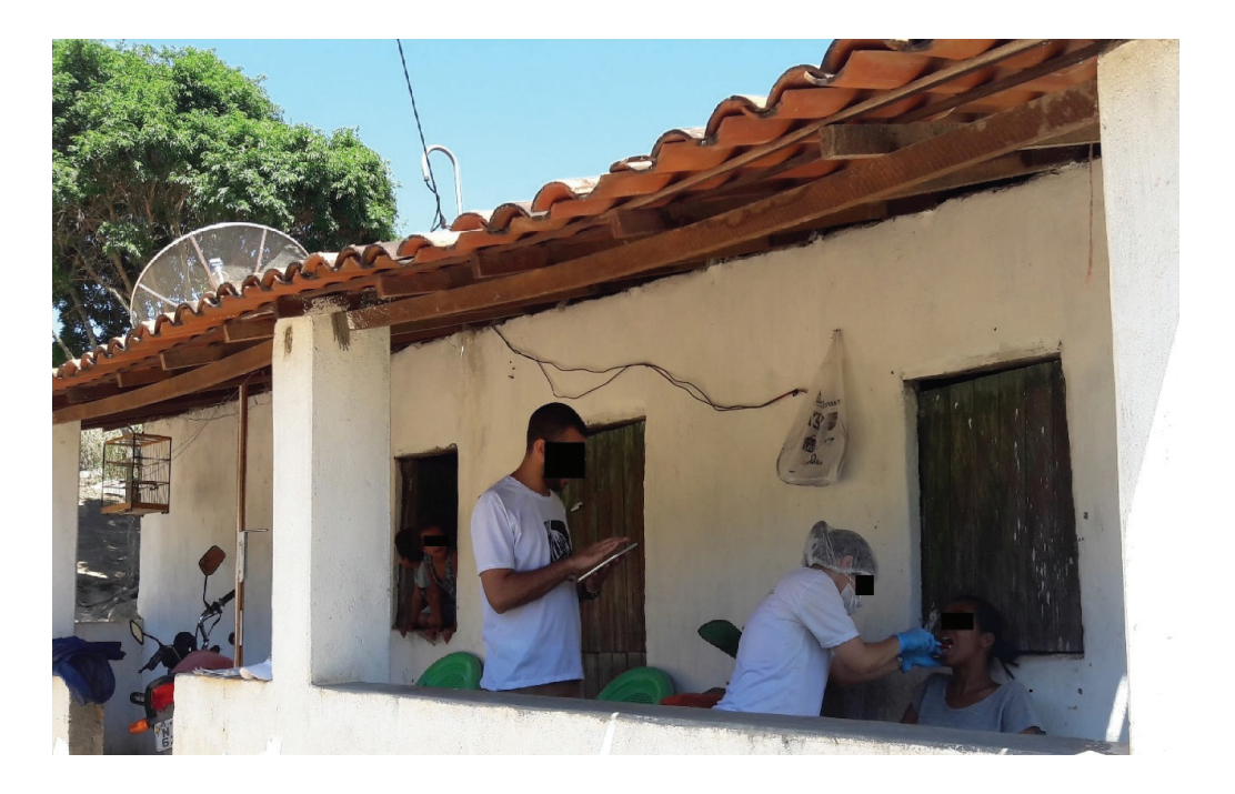
Figure 2. Performing clinical oral examination during home visit in a village of the Xukuru Territory of Ororubá. Pesqueira, 2018.

During the home visits, oral health interventions were performed: clinical oral examinations (Figure 2) and guidance to participants/families regarding oral health care and healthy eating, taking into account the socioeconomic, cultural, and geographic reality of that people. At the end of each visit, oral hygiene kits with a toothbrush, fluoride toothpaste, and dental floss were given to specific cases.