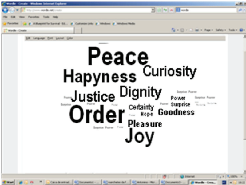
Picture 5 – Image of the utopia deposited in the mind of 28 Brazilian respondents

http://www.wordle.net/delete?index=8239899&d=CAHP