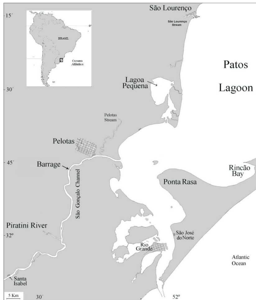
Fig. 1. Patos Lagoon southern region showing Lagoa Pequena bay where the specimens of Limnoperna fortunei and water to the experiment were collected.

The relationship between salinity and exposure time was evident, which coincided with the number of