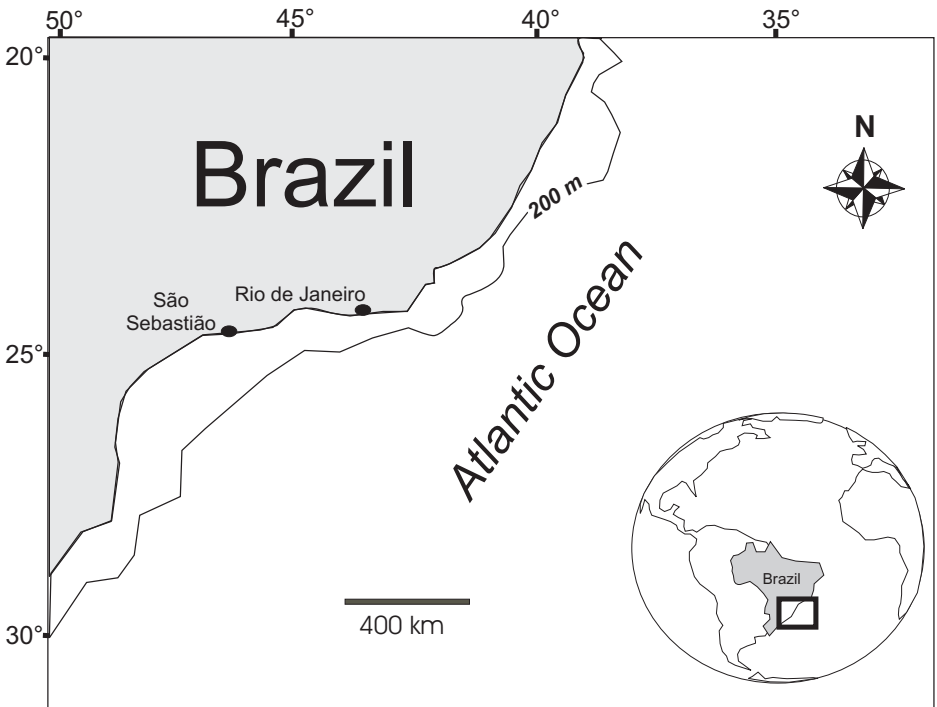
Fig. 1. São Sebastião, located in the northern coast of São Paulo State, Brazil.

Additional material examined. Brazil, Rio de Janeiro, Guanabara bay. Eleven carapaces and six valves.