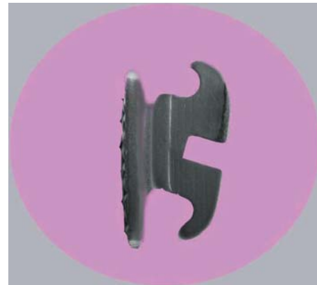
Figure 1- Fixation of the brackets in the template

The torque was measured in the images by means of demarcating reference points and lines. Two points were demarcated at the base of the brackets (Figure 2): point B1 (cervical extremity of the bracket base) and point B2 (occlusal extremity). Two points were also demarcated on the slots, at