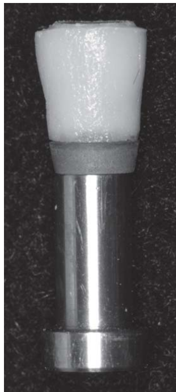
FIGURE 5- Porcelain applied to the abutments

With the use of abutment rectifiers (test group - M2),