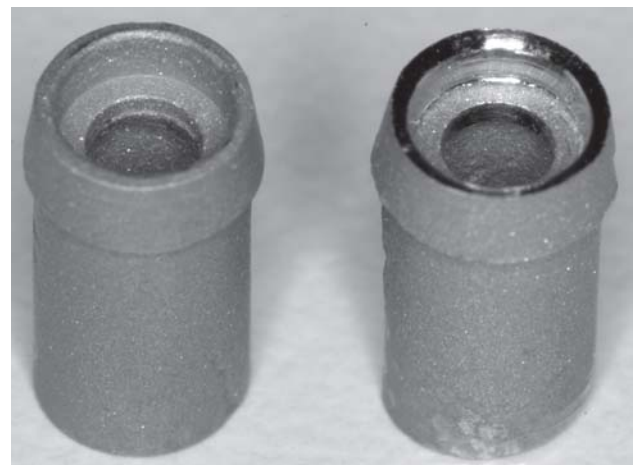
FIGURE 3- Cast abutments before and after the use of rectifiers