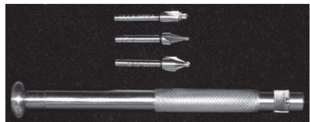
FIGURE 2- Cast Rectifiers