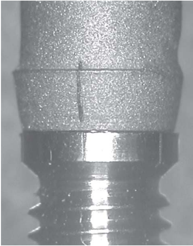
FIGURE 6- Cast Abutment on implant

there was significant reduction of the marginal misfit of cast UCLA abutments, from 25.68 \mu\text{m} to 14.83 \mu\text{m} . After ceramic application (M3), the cast abutments presented marginal