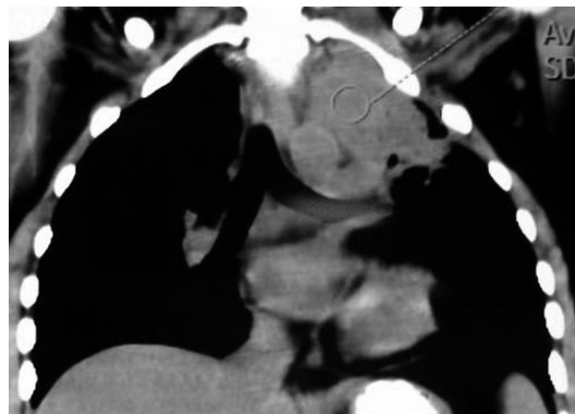
Figure 2 - Chest CT scan revealing a mass invading the chest wall, without cleavage planes and with mediastinal structures.

Pulmonary actinomycosis generally results from the aspiration of oropharyngeal or gastrointestinal secretions into the respiratory tract. (8) Alcoholism, poor oral hygiene, and dental caries can also contribute to the development of the disease. (8) This type of infection generally involves the cervicofacial region in approximately 55% of the cases, (3,6,7,9,10) the thoracic region in approximately 15% of the cases, (1,3,6,7,9,10) and