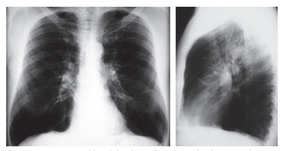
Figure 1 – Routine anteroposterior and lateral chest X-ray of a patient with pulmonary emphysema secondary to alpha-1 antitrypsin deficiency. Note the signs of hyperinflation and hypertransparency of the lung parenchyma clearly predominant in the lung bases.

It has been suggested that there is a relationship between AAT deficiency and asthma, although such