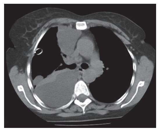
Figure 2 – CT scan of the thorax revealing right pleural effusion, thin septa, and atelectasis of the underlying lung.