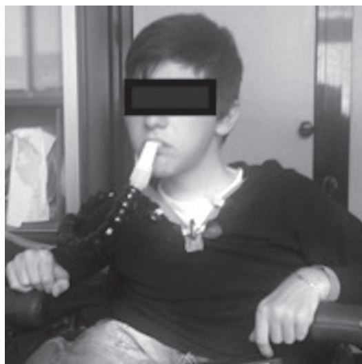
Figure 1. A patient during mouthpiece ventilation.

All of the patients had previously refused to use NIV, but accepted treatment with MPV. The preferred mode was pressure control (Table 1). IPAP was set between 10 and 14 cmH 2 O, which ensured an optimal tidal volume (8-10 mL/kg). No back-up rate was needed during